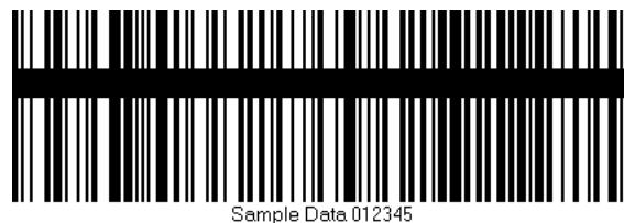
Figure 6: Barcodes rendered without valid license