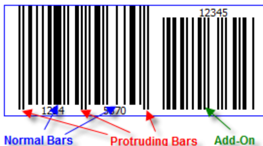
Figure 5: EAN8 with 5 add-on digits

Add-on sections start with ASCII (253) . They continue until the end of the code. Add-on bars leave space for the text above the barcode and align at the bottom with the protruding bars.