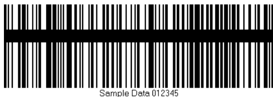
Figure 6: Barcodes rendered without valid license

In UNIX: BCLicenseMe() should be called directly after BCInitLibrary() .