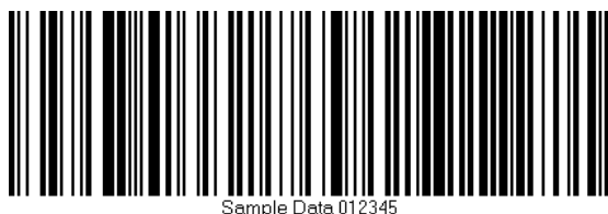
Figure 7: Barcodes rendered with valid license