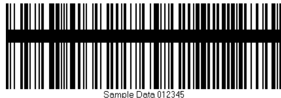
Figure 2: Barcodes rendered without valid license