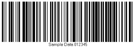
Figure 3: Barcode rendered with valid license.