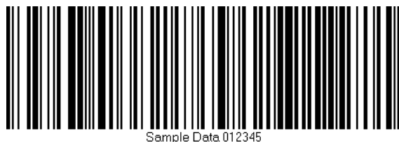
Figure 3: Barcode rendered with valid license